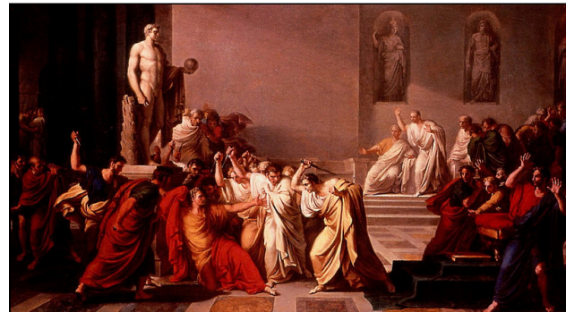
"The Death of Julius Caesar" by Vincenzo Camuccini is in the public domain.

[A crowd of people; among them ARTEMIDORUS 1 and the Soothsayer. 2 Flourish. Enter CAESAR, 3 BRUTUS, 4 CASSIUS, 5 CASCA, DECIUS BRUTUS, METELLUS CIMBER, TREBONIUS, CINNA, 6 ANTONY, 7 LEPIDUS, 8 POPILIUS, PUBLIUS, 9 and others]