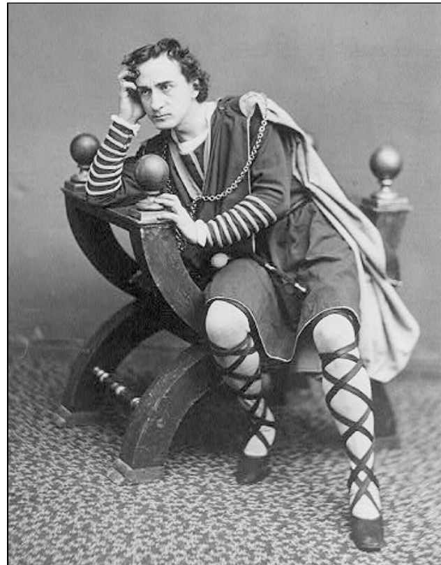
"Hamlet, The Philosopher"